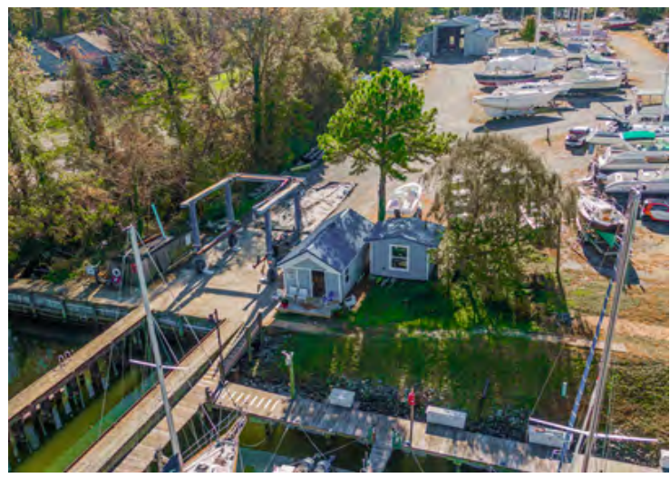
Lift Well and Sheds